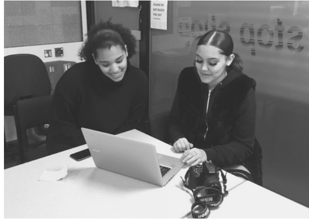
1:1 YPVA SUPPORT